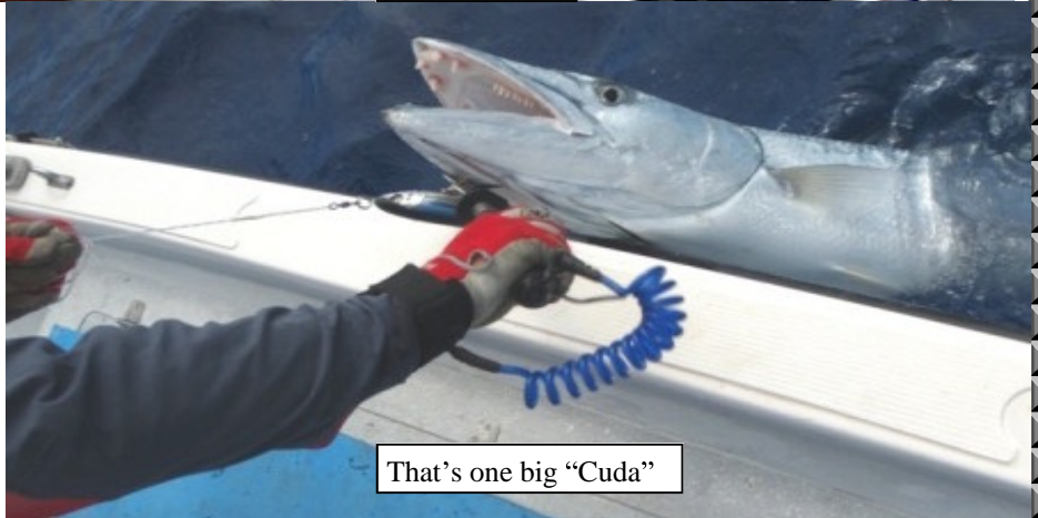
That's one big "Cuda"