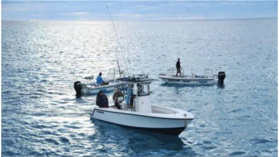
Above: Some of the boats Below: Casting with poppers and jigging, this might be too energetic for some.

This was a 'dory' trip which means that everyone fishes from Nomad's 3 16' Kevlacat side console boats or from their new 25' Contender centre console, which gives everyone ample opportunity to do both shallow water fishing and get some deep water jigging and pelagic action as well.