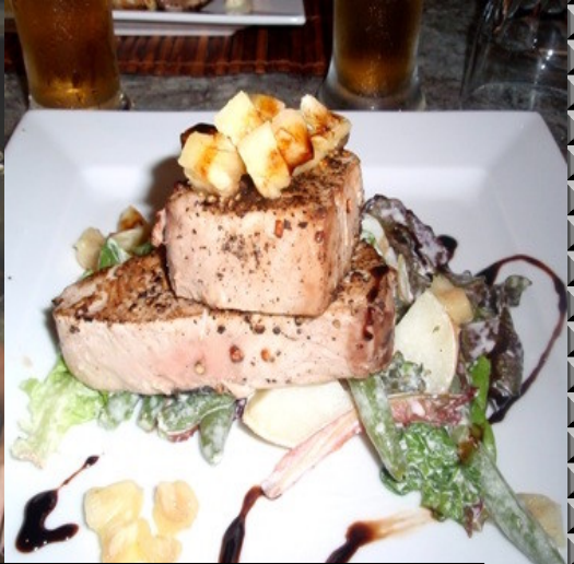
Tara serves up dinner. Some of the other dishes including dessert