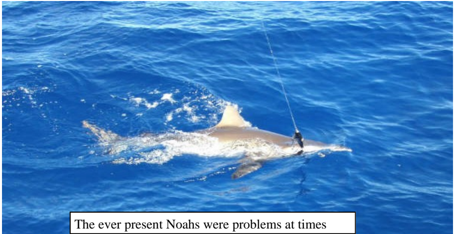
The ever present Noahs were problems at times

After quick introductions and a chat with some blokes I know in the departing party, it was down to the serious business of fishing. While the location was absolutely spectacular and the operation completely first class, the fishing was rather tough for most of the week. Both the tides and moon were pretty good and the fish were definitely present, but we all had to work very hard to get hits. Keeping the 'Doggies' away from the voracious sharks became the next big challenge as they monstered many of the good fish hooked over the first few days (particularly mine!).