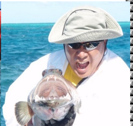
Left: Not all fish were lineburners. Right: Check out those fangs; watch the fish's too