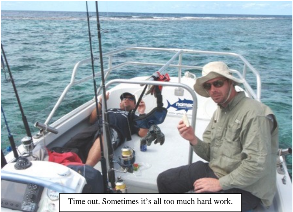
Time out. Sometimes it's all too much hard work.

Picked up Blue Water Mag yesterday with Malcolm Crane on the front with a GT, it has a good article inside by Damon with a few pics from our trip thrown in, the full page picture of Brandon casting around the 'Blue Holes' really shows Marion Reefs beauty.